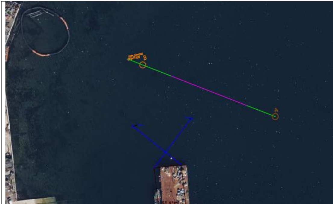
Figure 2 Wave Attenuation as Laid Positions.